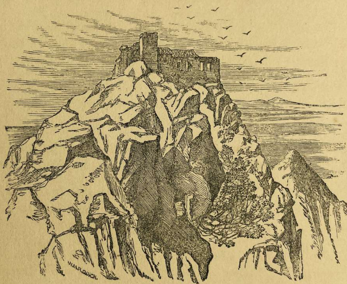
Convent of S. Silvestro, Summit of Soraete.