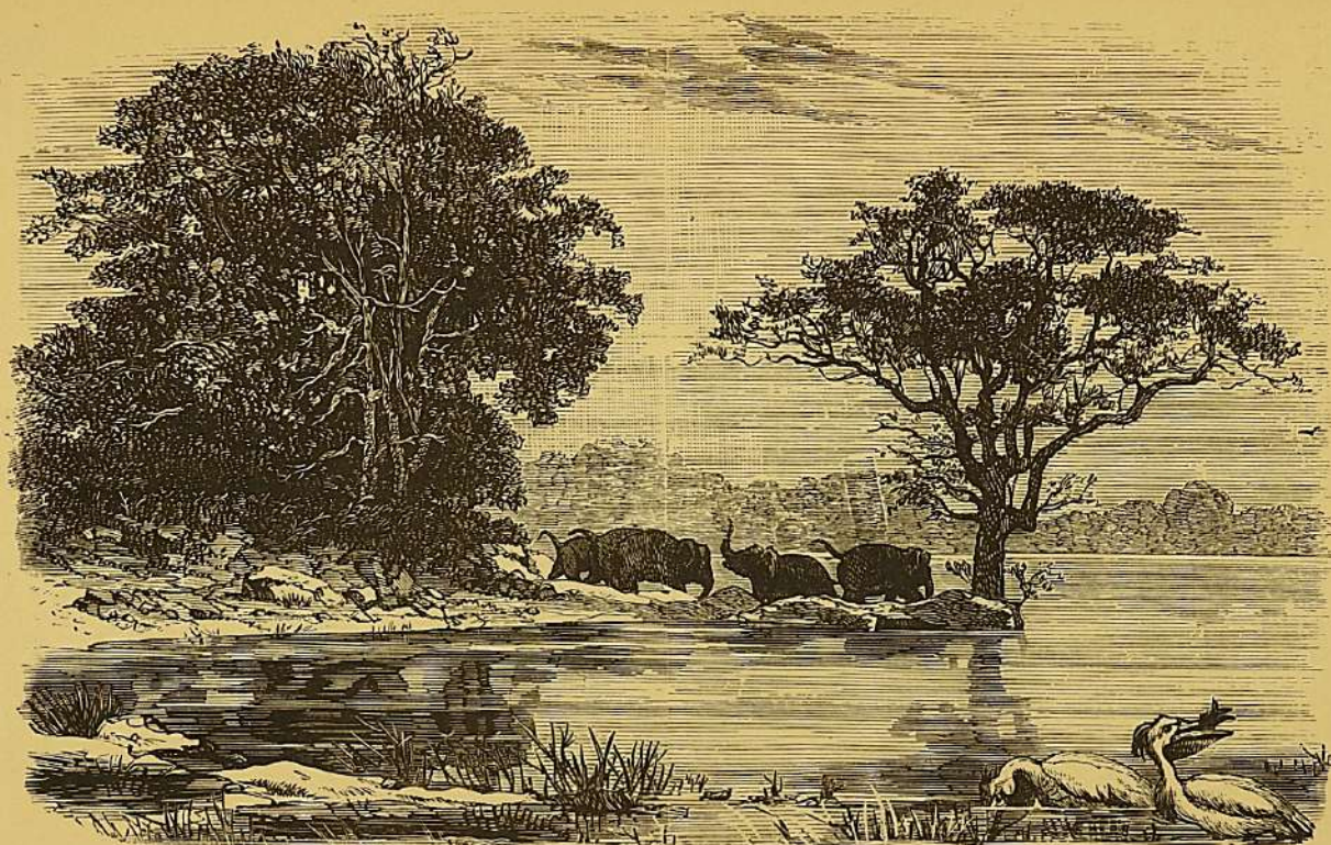
TOPARI TANK, NEAR THE RUINS OF POLONARUWA.