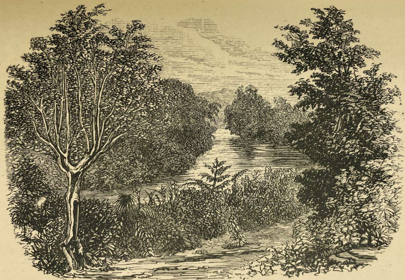
SCENE ON THE NILWELLEGANGA : SOUTHERN PROVINCE.