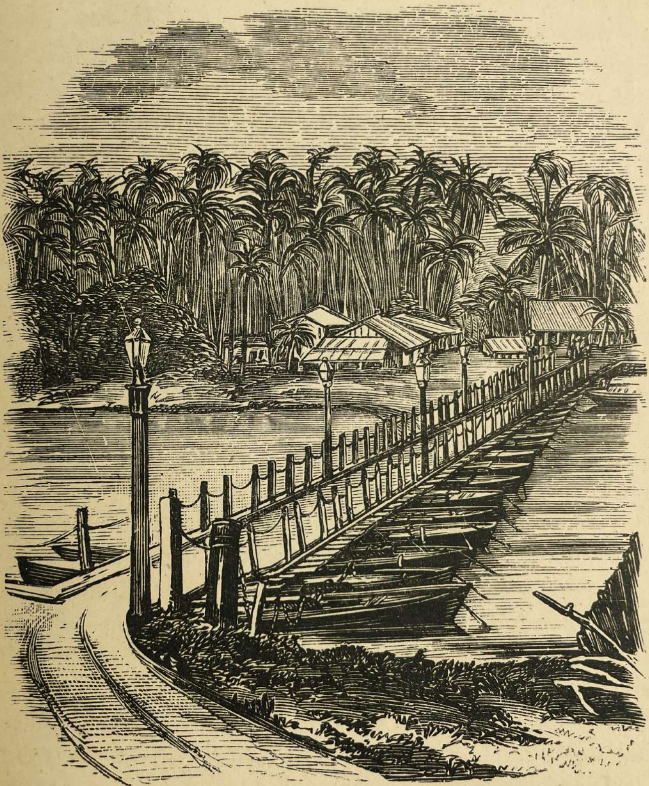
BRIDGE OF BOATS, COLOMBO,

1831—1893 ( now to be superseded by a permanent Iron Girder Bridge ).