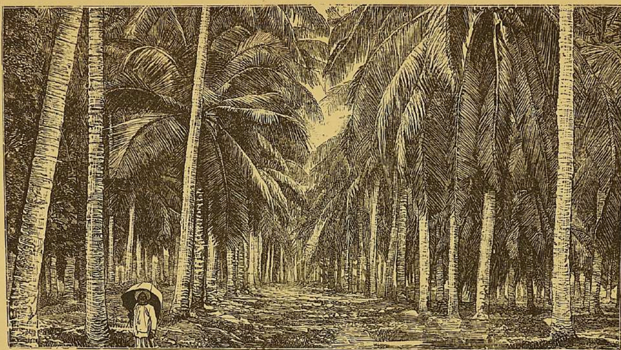
A COCONUT PLANTATION.