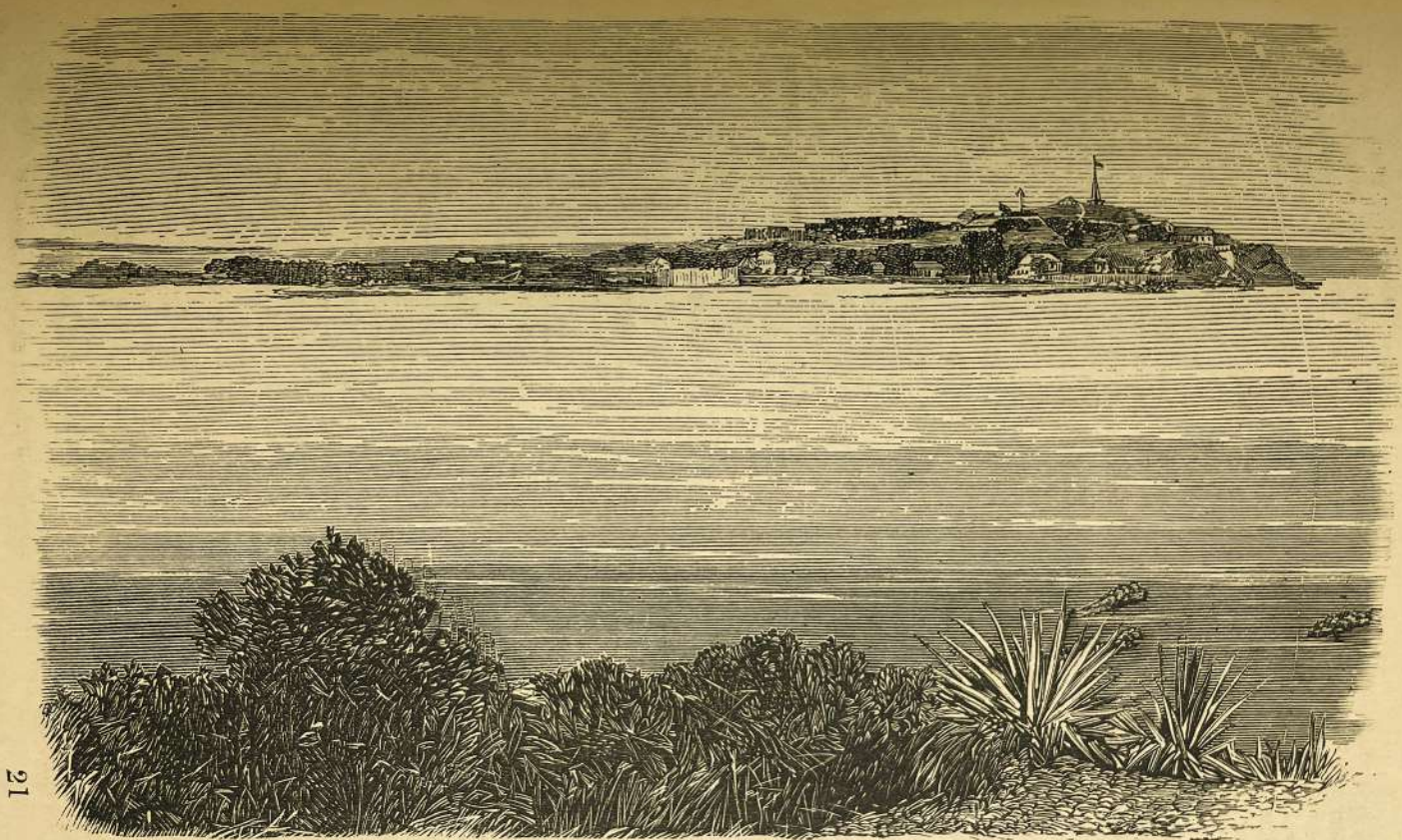
VIEW OF FORT FREDERICK AND PART OF DUTCH BAY, TRINCOMALEE.