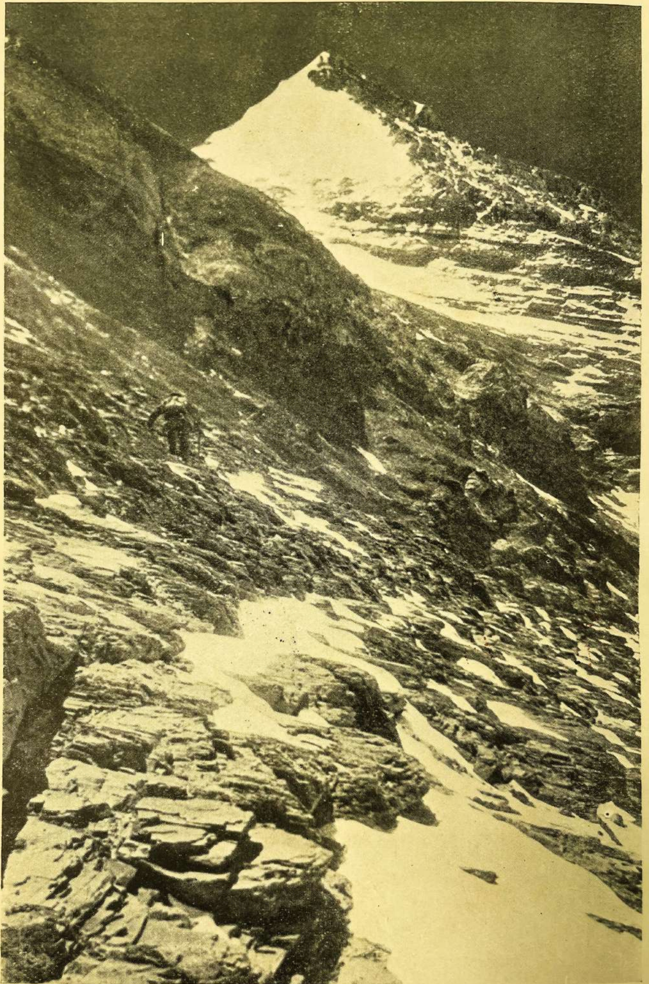
COLONEL NORTON AT 28,000 FEET.