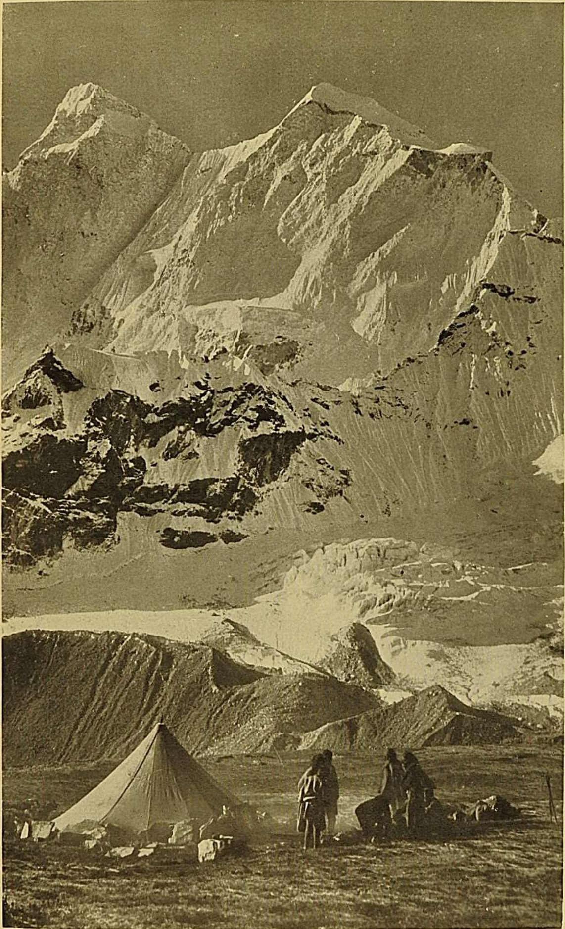
CLIFFS OF CHOMOLÖNZO FROM CAMP AT PETHANG RINGMO.