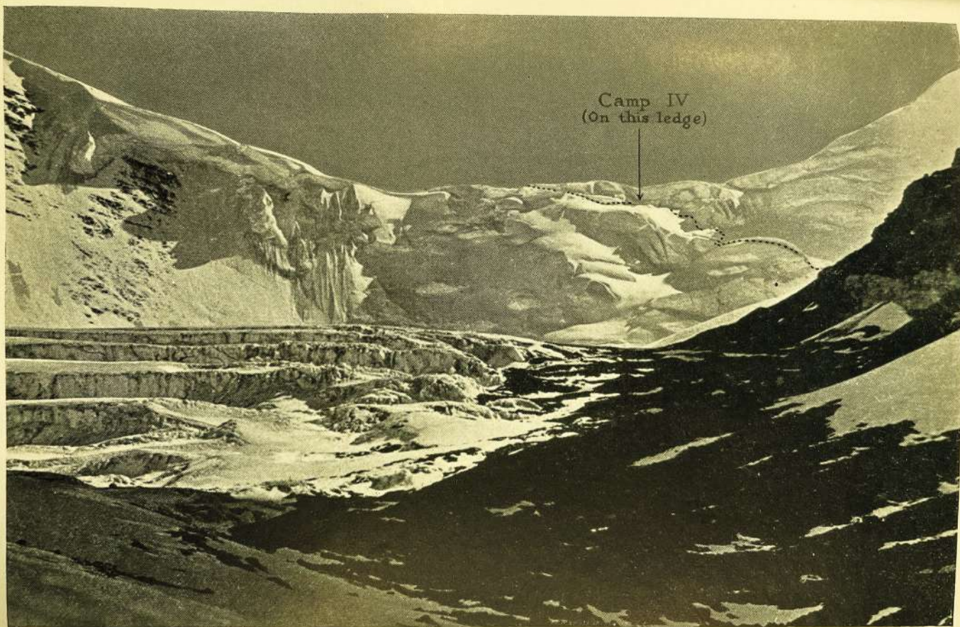
THE ROUTE TO THE NORTH COL.