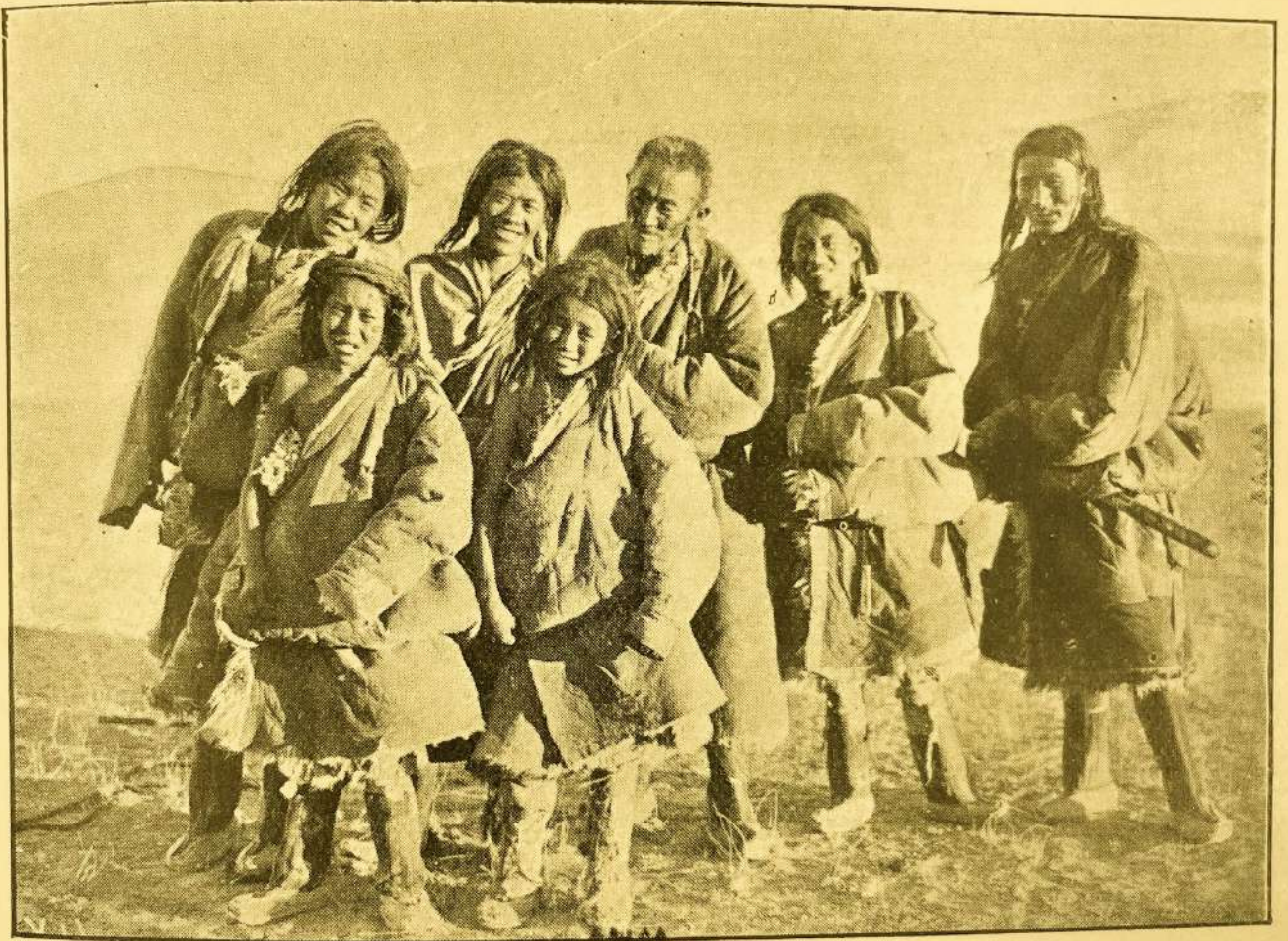
A Group of Tibetans.