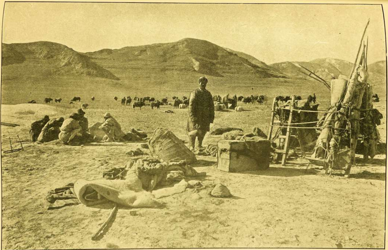
Our Camp near the Western Shore of Lakkor-tso.