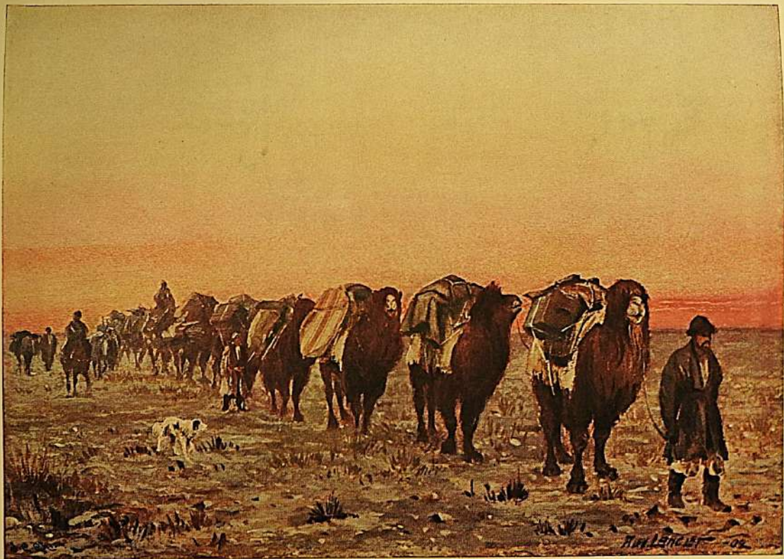
The Caravan Marching through the Desert of Gobi.