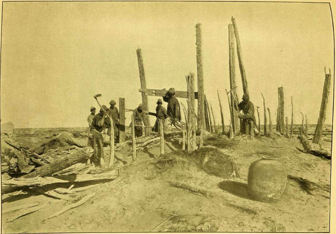
Excavating a House in Lóu-lan. In the Foreground the Big Earthenware Jar.