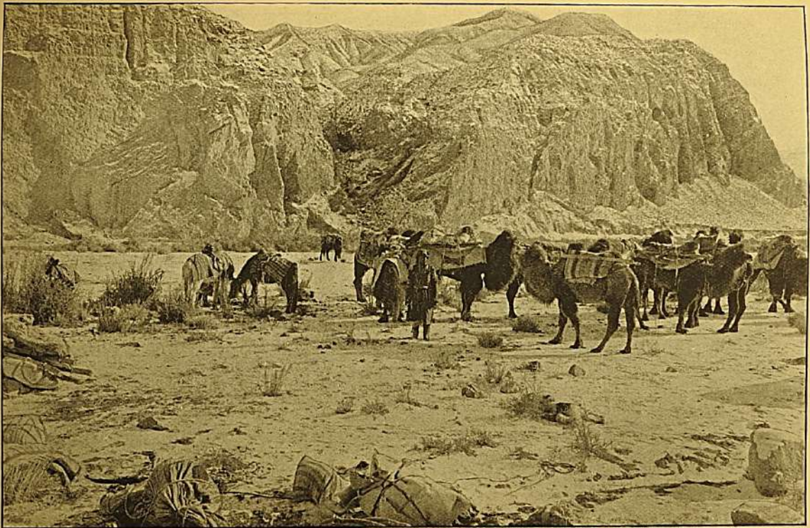
Our Camels at Jong-duntsa.