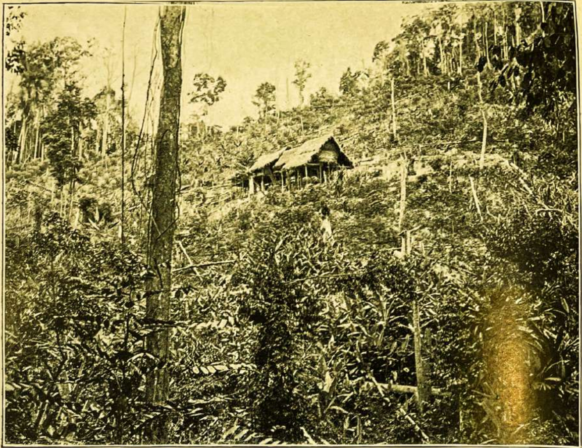
ABORIGINAL HILL CLEARING, WITH HUTS, ULU BATU, SELANGOR.