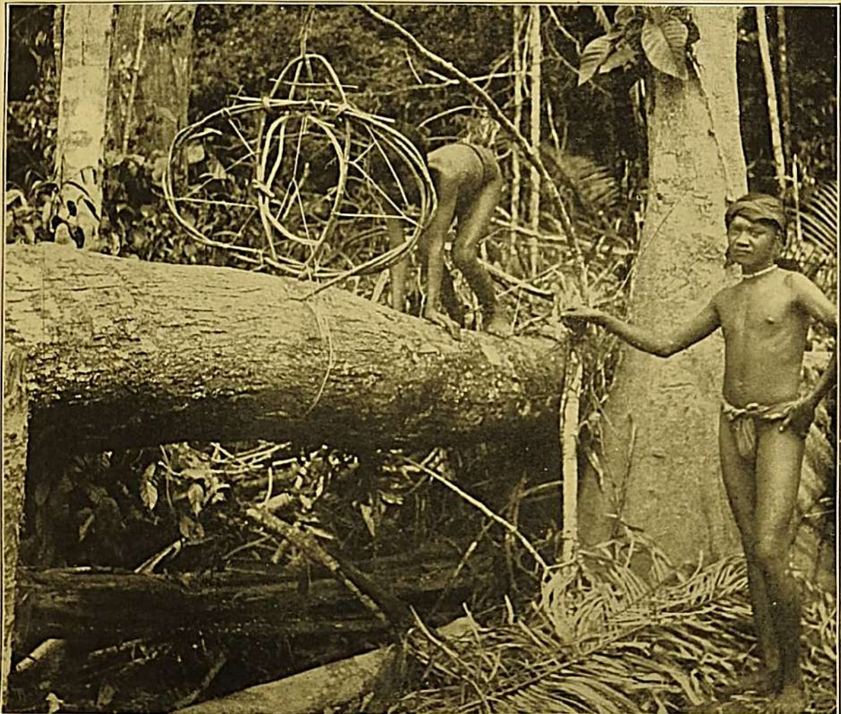
SAKAI WITH TRAP, PERAK—BOY EXPLAINING ITS ACTION.