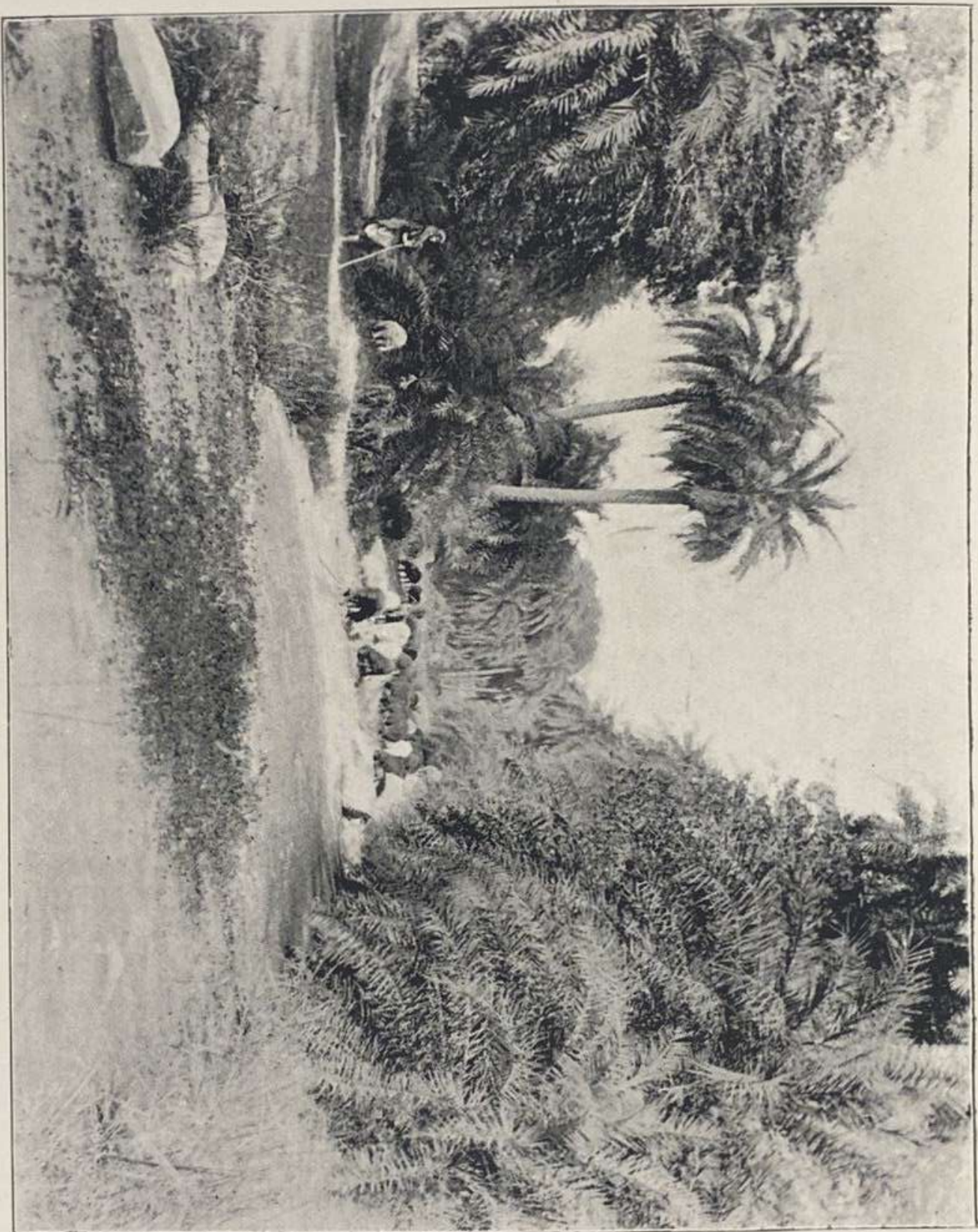
A QUIET DELL IN JHANSI.